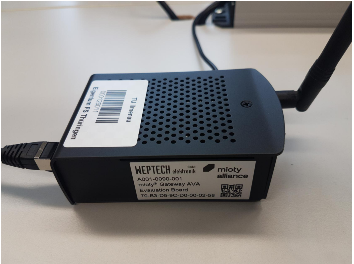
The mioty Gateway.